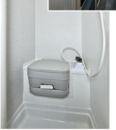
Atom 600 interior includes a porta-potty/shower